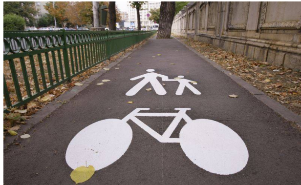
The Municipality has spent over 10 million euros for bicycle lanes. Some of them look like this.