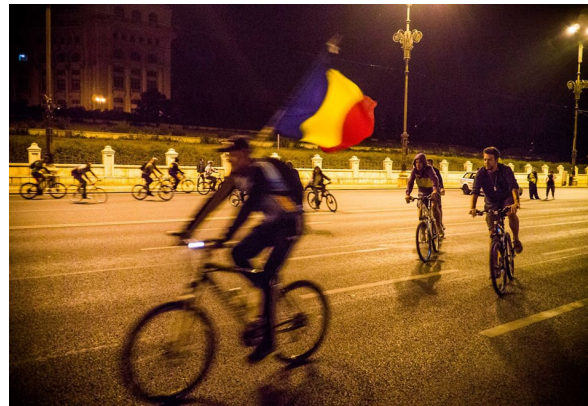
A recent bicycle protest in Bucharest.