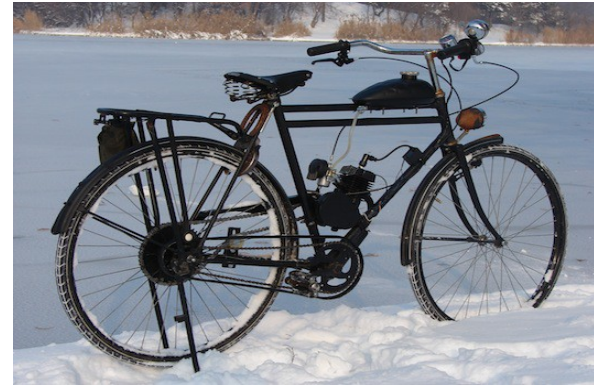
Andrei's ratbike, a motorized bicycle. Many of the bicycle builders in Bucharest are also activists.